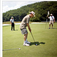
Association of Golf Club With A.I.G. Still Rankles