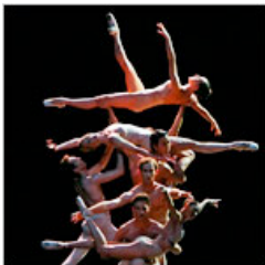
Meeting of Many Minds (and Bodies)