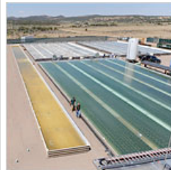
Tribe in Colorado Invests in Algae Fuel